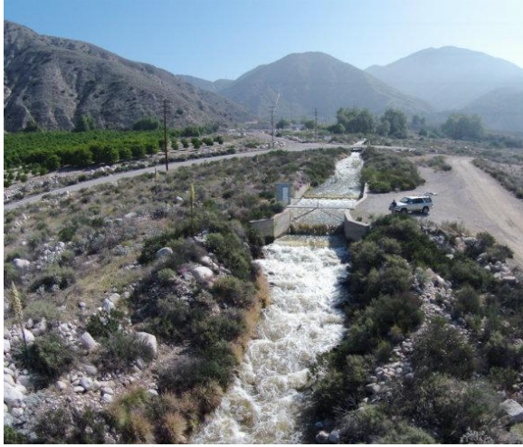
Water recharge in native habitat

Our vision for the San Bernardino Valley Conservation Trust is based on the belief that the unique natural resources and open space which support the needs of native plants, animals, and people should be cooperatively and effectively managed to ensure the vitality of the San Bernardino Valley now and for the future. Through the Conservation Trust, we are actively working towards making that vision a reality.