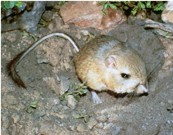
The San Bernardino Kangaroo Rat ( Dipodomys merriami parvus ), is one of the endangered species we are fighting to protect.

San Bernardino Valley Conservation Trust's mission is to directly support the protection and stewardship of lands and endowments set aside for protecting natural resources, endangered species habitats, open space and outdoor recreational areas in the San Bernardino Valley through the Wash Plan and other future projects.